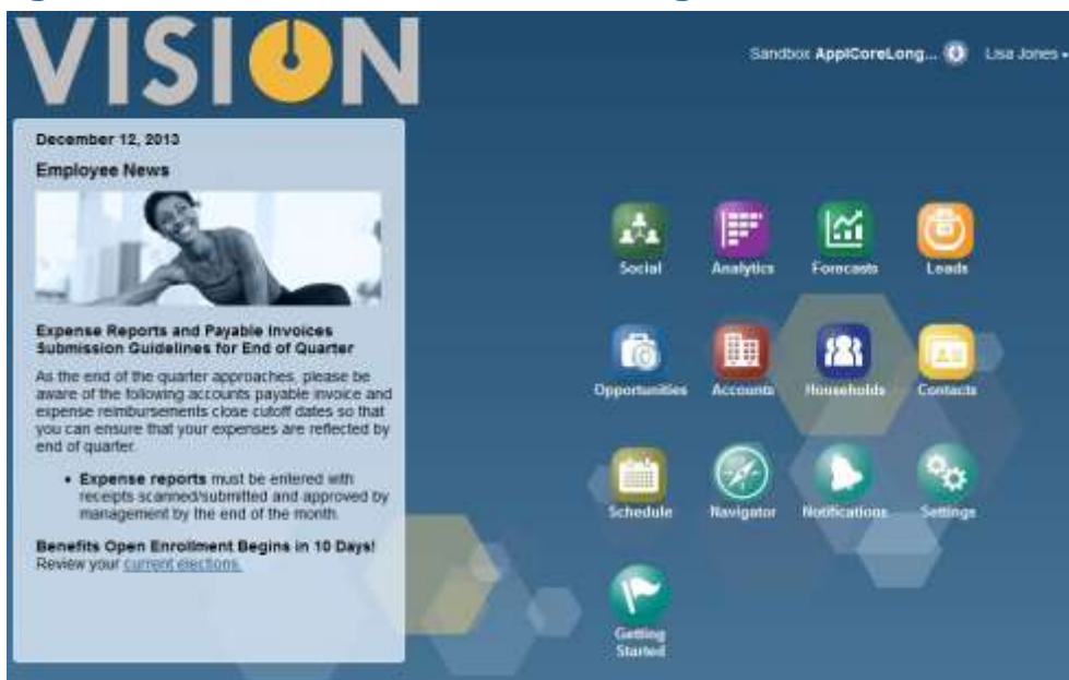
Figure 1. Oracle Sales Cloud Home Page Takes a Consumer Feel

Oracle delivered native interfaces for tablets and smartphones so they behave more like the other apps on those devices and not like a ported HTML5 desktop version of Oracle Sales Cloud. Better design and the ability to work hand-in-hand with mobility support are likely to overcome the perennial problem of user adoption. Many Oracle Sales Cloud customers commented on improved user adoption compared to their existing SFA (see Figure 2).