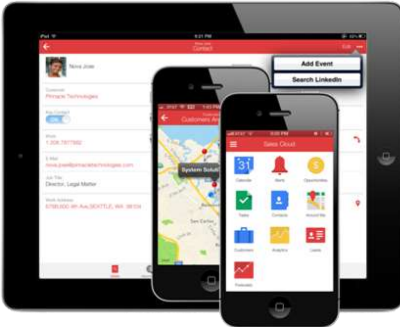
Figure 3. Oracle Provides Native Deployments for Android and iOS

Android versions of Oracle Sales Cloud Mobile app from Google Play and free iPhone and iPad versions from the Apple App Store.