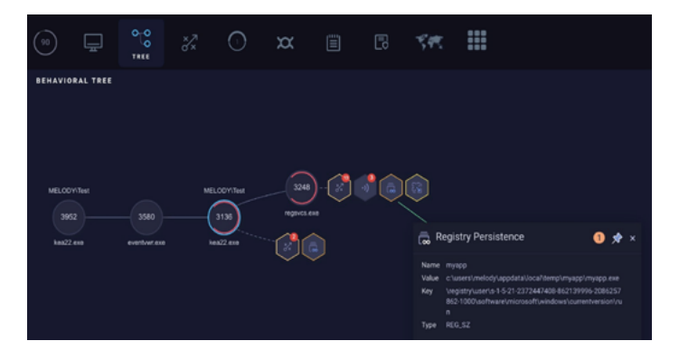
ReaQta behavioral tree provides full alert and attack visibility.